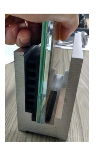
Step 4: Put in the adjustable gasket and use the Allen wrench to fix the screw as on below picture